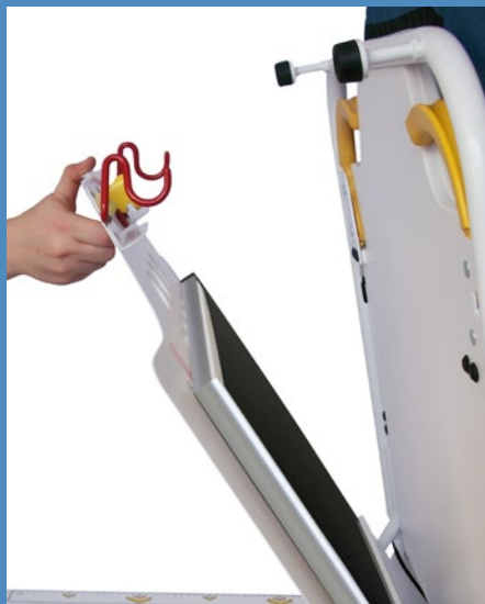
Upright Cassette Holder