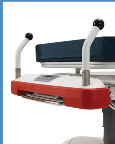
Foot End Push Handles (1105x only)

The Prime X X-ray Stretcher offers the safety and efficiency of the Prime Series Stretcher, now with the Clearview Technology platform.