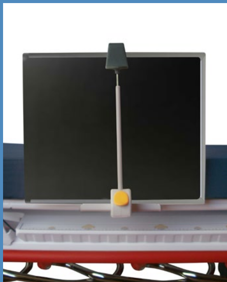
Lateral Cassette Holder