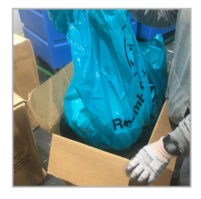
Login Each box is scanned in to identify which facilities the MATS came from.

the MATS came from. They are individually tallied to calculate the total quantity per hospital.