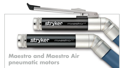
Maestro and Maestro Air pneumatic motors