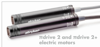
πdrive 2 and πdrive 2+ electric motors