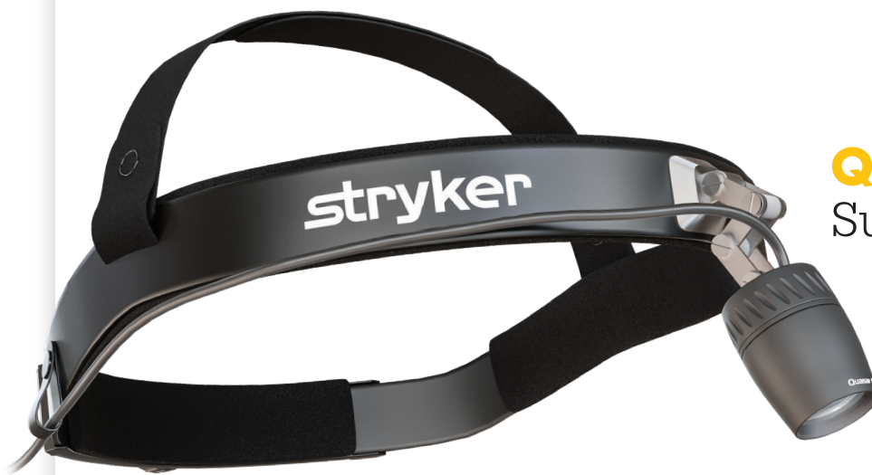
Quasar Surgical Headlight