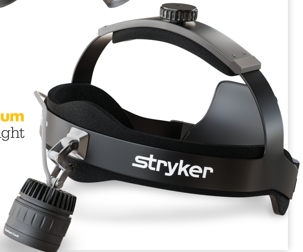
Quantum Surgical Headlight