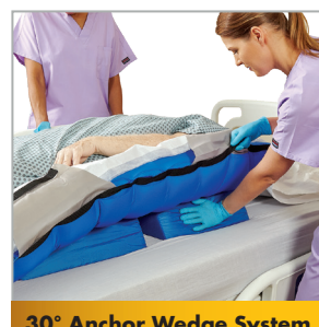
30° Anchor Wedge System

Safe positioning for healthcare workers and patients