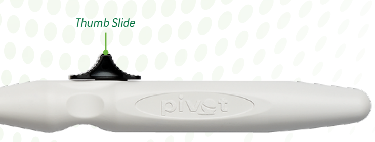
NanoPass Reach, Crescent (CATO2298)