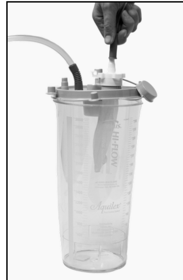
FIGURE 4: ATTACH VACUUM TUBE TO COLLECTION CANISTER

5. Non-sterile person attached the tissue removal device vacuum tubing to the corresponding connection on the tissue trap of the collection canister as shown in Figure 4.