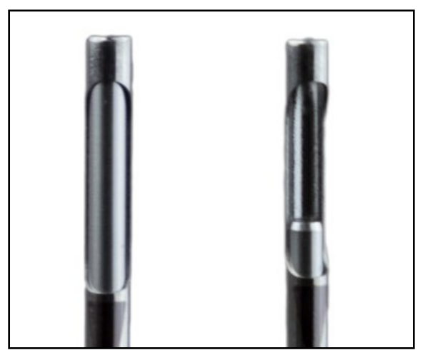
FIGURE 5: Closed Tissue Removal Device Cutting Window on Left