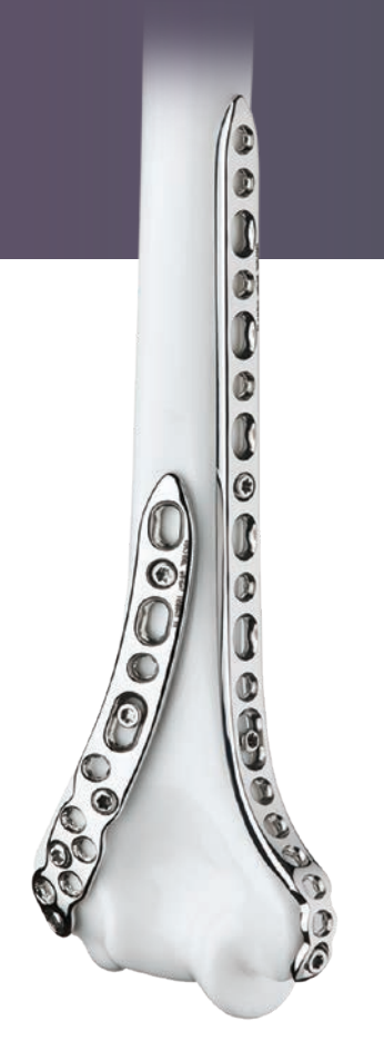
Medial/Posterolateral - 90° (orthogonal)